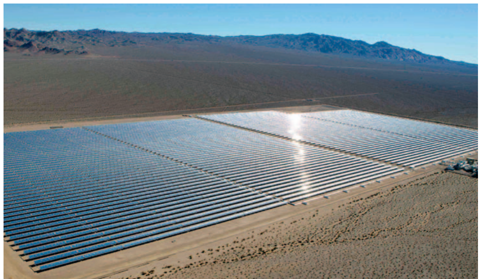
64-megawatt solar plant in Boulder City, Nevada

Contact the EERE Information Center 1-877-EERE-INF or 1-877-337-3463 or visit www.solar.energy.gov or www.solaramericacities.energy.gov