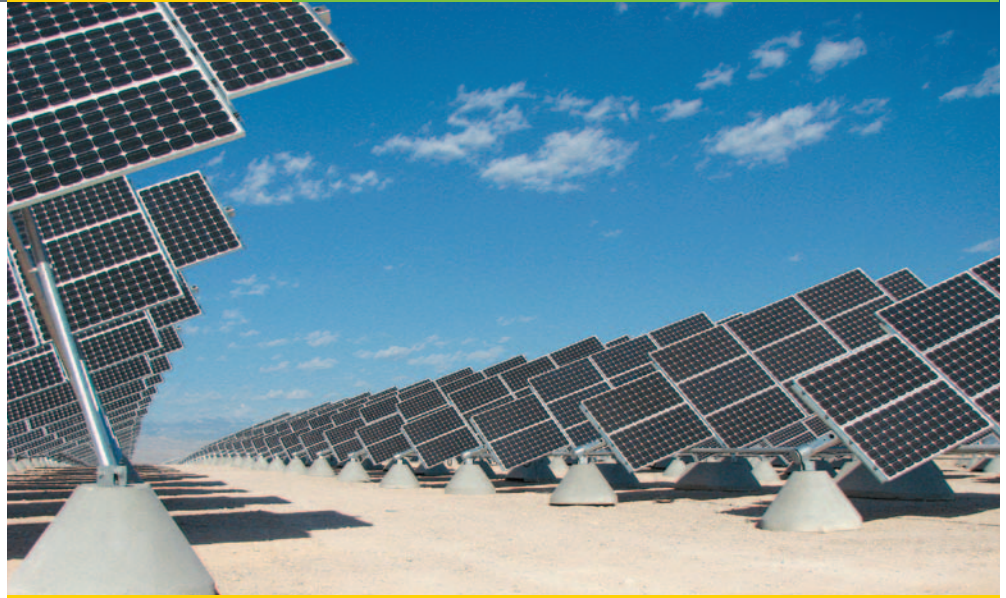
14.2-megawatt solar electric system at Nellis Air Force Base, Nevada