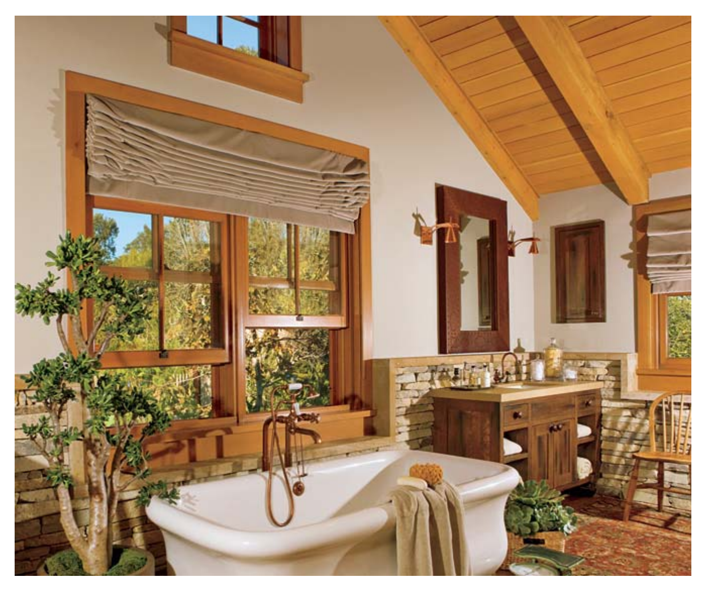
Fagen describes the master bath as both "masculine and functional." Roman shade fabric, Clarence House. Limestone for pullman tops and ledge, Exquisite Surfaces. Tub and copper faucets, Waterworks. Wall stone, Walker Zanger.