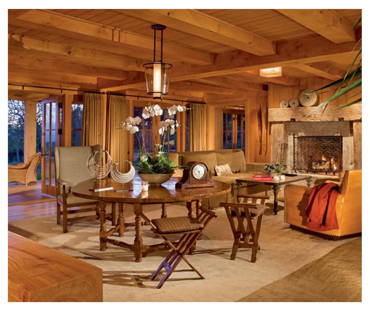
The living area. Necklaces, Kneedler|Fauchère Imports. Drapery fabric, Clarence House. Club chairs, Ralph Lauren Home. Tufenkian carpet. Hanging light, Holly Hunt. Wood bench, Mimi London. Wing chair, low table, stools and sofa, Gregorius|Pineo.